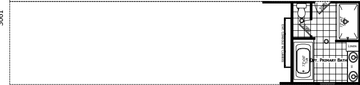
OPT. MBATH WITH 72" TUB & 72" SHOWER