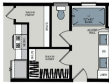
ALT PRIMARY BATH 1