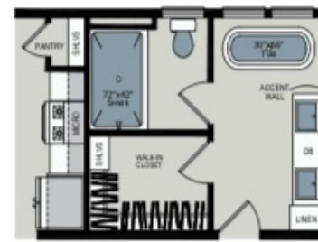
ALT PRIMARY BATH 2