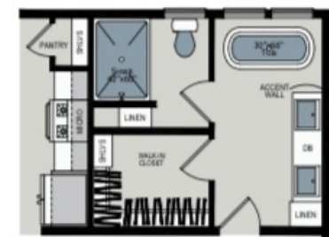
ALT PRIMARY BATH 3